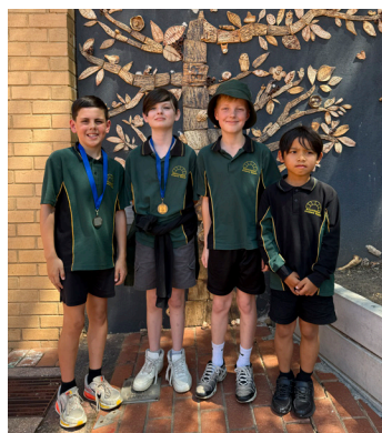
Rock, Paper, Scissor Champions

Thank you for your continued support as we navigate this busy and vibrant end to the school year.