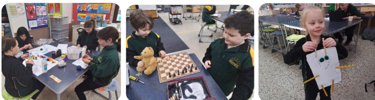
Some images from the previous week at OSH of the children