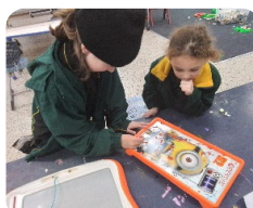
A game of operation